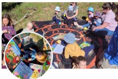
Mount Egerton Nature Playgroup

Mount Egerton Primary School is offering playgroup!